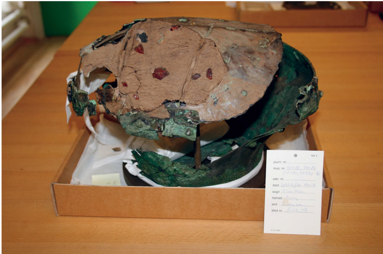
Figure 7. Image of the Lusehøj bronze urn which contained cremated human remains wrapped in a nettle textile from c. 2800 BC. The Lusehøj burial mound is one of the richest Bronze Age burials from Denmark.