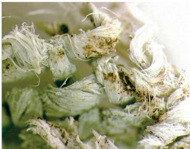
Figure 8. A close-up image of the Bronze Age nettle textile found inside a bronze urn at the Danish site of Lusehøj, whose strontium isotope composition revealed a potential Austrian origin.

one of the most impressive centres of power during the Scandinavian Bronze Age. Voldtofte has several impressive burial mounds and the largest amount of gold from that period within Scandinavia has been unearthed there. One of the burial mounds, Lusehøj, which has been interpreted as a princely burial, contained a bronze urn (Fig. 7) with cremated human remains which were wrapped in a nettle textile from c. 2800 BC (Bergfjord et al., 2012; Frei et al., 2015).