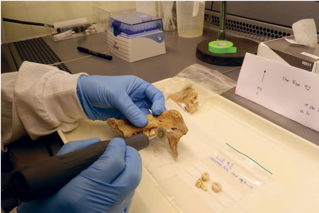
Figure 2. Sampling tooth enamel from the first molar of an individual dating back to the Bronze Age at the Danish Centre for Isotope Geology (DCIG) at the University of Copenhagen.

Figures 2 and 3 depict how tooth enamel samples are taken after previously being deeply rinsed; only a few milligrams of tooth enamel are necessary to conduct a reliable strontium isotope analysis.