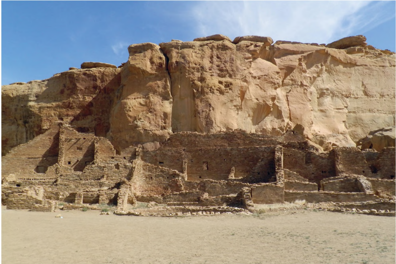
Figure 4. Image of the pre-Columbian site of Pueblo Bonito (AD 850-1150) in Chaco Canyon, USA. The very dry conditions at the site have enabled the preservation of maize cobs as well as wood beams, both of which have been investigated with the strontium isotope system to determine their provenance.

cieties. The Chaco people of Pueblo Bonito are known to have constructed monumental ‘great houses’ with roof beams as well as water-controlled systems for agricultural purposes and an impressive network of roads. Since the main function of the Chaco cultural system of ‘great houses’ and roads is not yet understood – there may have been economic, political or ritual reasons – a provenance study of the Chacoans’ main food source could provide important information that would help to resolve this issue. A group of scientists therefore conducted strontium isotope analyses and elemental analyses of some of the cobs from the Pueblo Bonito site (Benson et al., 2003). The strontium isotope analyses revealed that the maize cobs were of non-local origin and that they came from a place at least 80 km from the Pueblo Bonito site. Moreover, the cobs