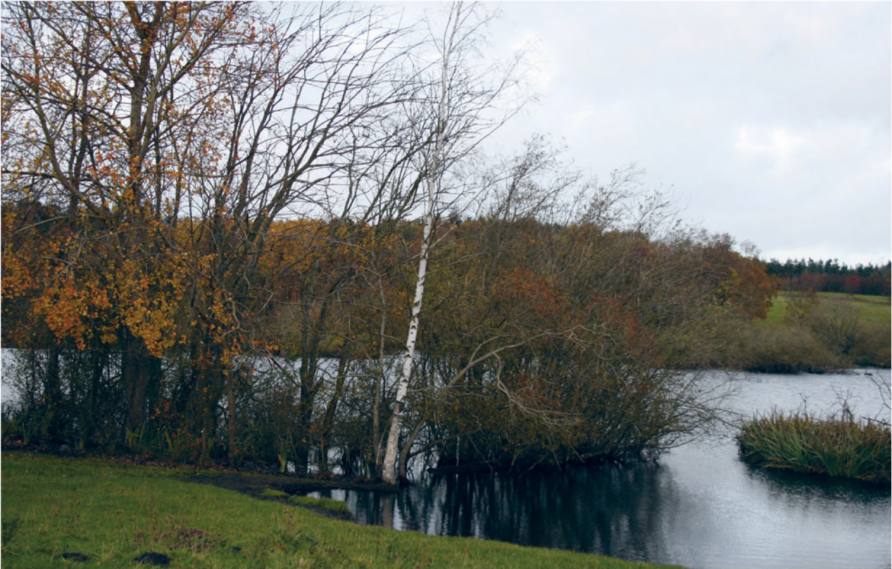
Figure 5. Image of the Huldremose bog site, northeastern Denmark. At this site pre-Roman Iron Age (500 BC – AD 0) textiles have been recovered twice. One of the cases was the single deposition of a large tubular textile which proved to be made of a mixture of local and non-local wool.

This large textile garment (Fig. 6), was made of a very homogeneously spun wool, and was woven in a technique indicating that the garment was of local origin. However, the 11 random wool samples showed that the wool of which this garment was made originated from sheep that grazed in several different regions, including regions outside mainland Denmark (defined as Denmark excluding the island of Bornholm). Hence, the authors argue that even though the textile might have been woven locally, the wool was gathered from several places, some of which were outside Denmark.