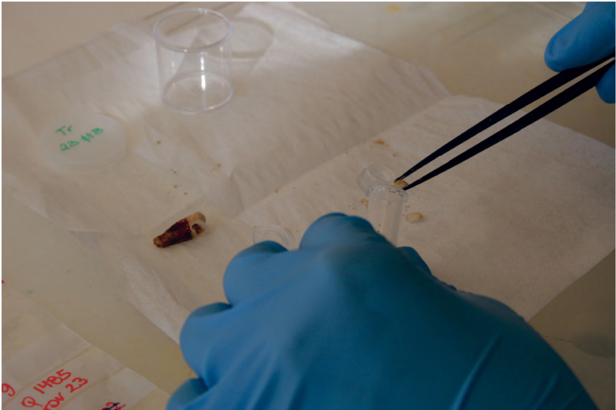
Figure 3. Tooth enamel sample from one of the individuals buried at the largest of the three mass graves at the Trelleborg fortress, at the Danish Centre for Isotope Geology (DCIG) at the University of Copenhagen.

that is outlined by Denmark today (excluding the island of Bornholm).